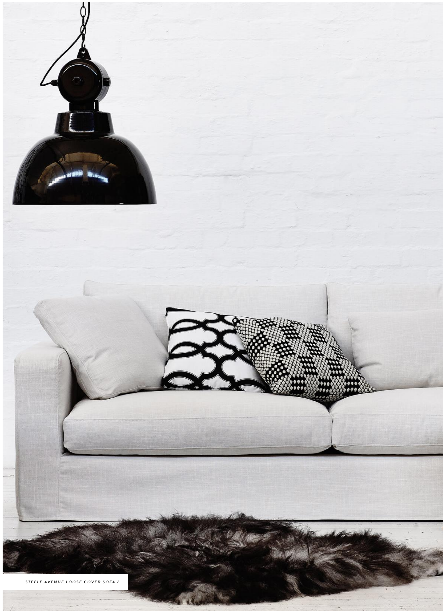
STEELE AVENUE LOOSE COVER SOFA /